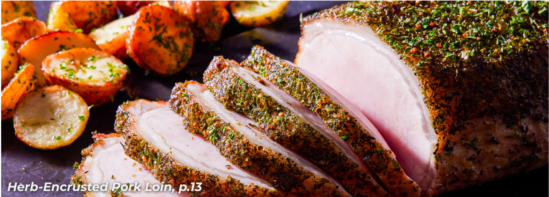
Herb-Encrusted Pork Loin, p.13

All Food and Beverage and Audio Visual services are subject to a 22% Management Charge. The entirety of this Management Charge is the sole property of the venue owner/operator and is used to cover that party's costs and expenses in connection with the administration of the event (excluding employee tips, gratuities, and wages).