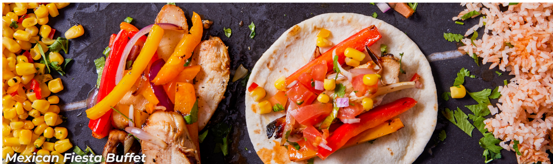
Mexican Fiesta Buffet