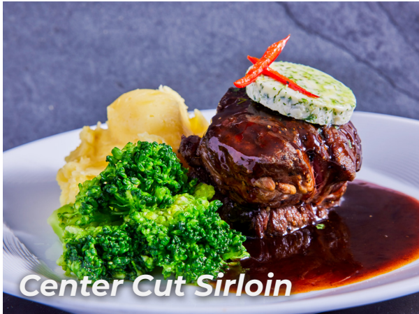
Center Cut Sirloin