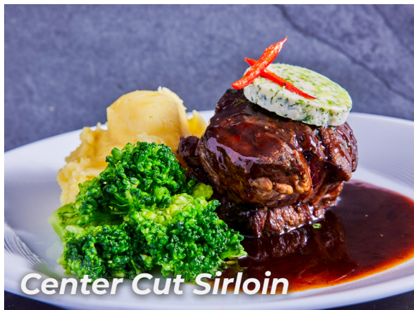
Center Cut Sirloin