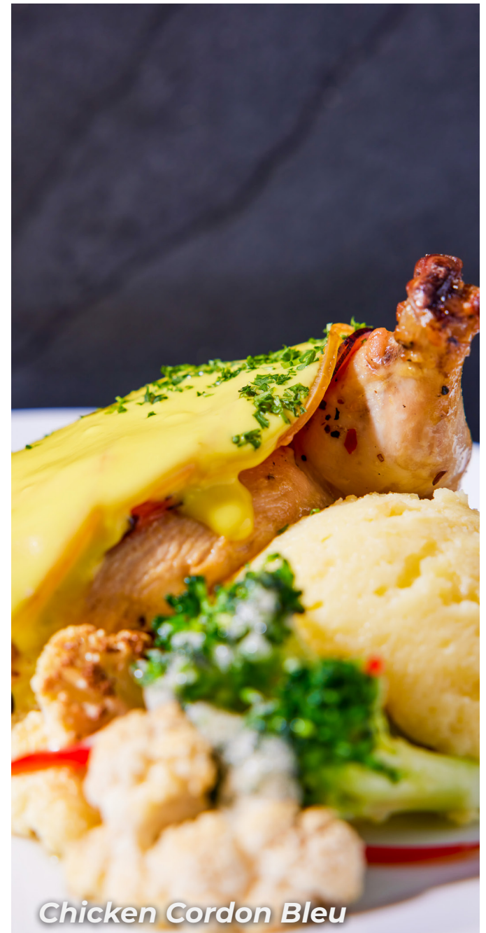
Chicken Cordon Bleu

Herb Wild Rice Forbidden Rice Mascarpone Mashed Potatoes Oven-roasted Bliss Potatoes Roasted Yams Whipped Yukon Gold Potatoes