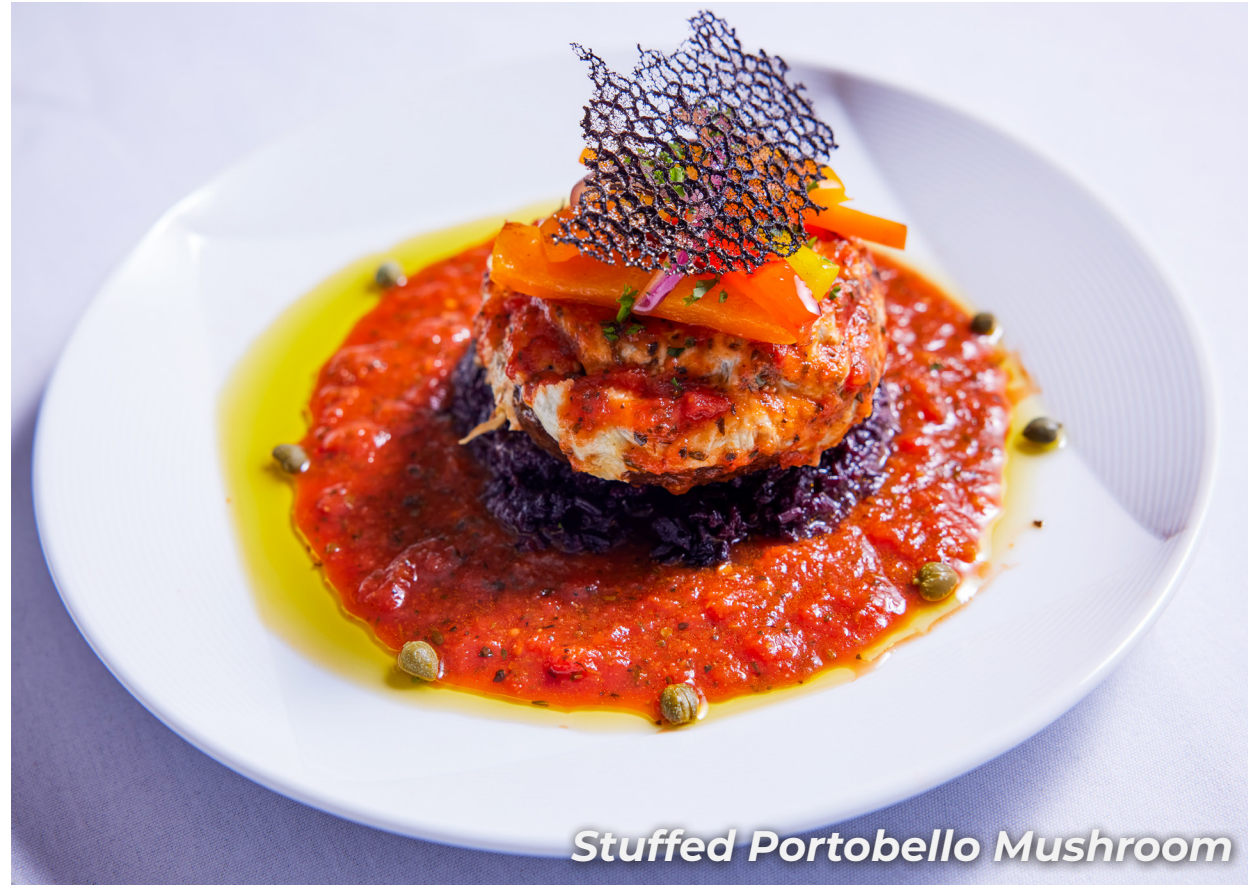
Stuffed Portobello Mushroom

Marinated Portobello Mushroom Sautéed Garden Vegetables Mozzarella Cheese Red Pepper Sauce