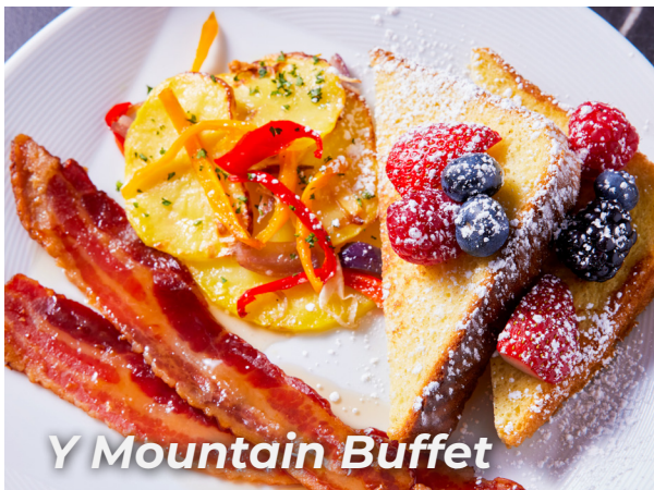
Y Mountain Buffet