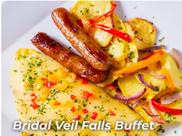
Bridal Veil Falls Buffet