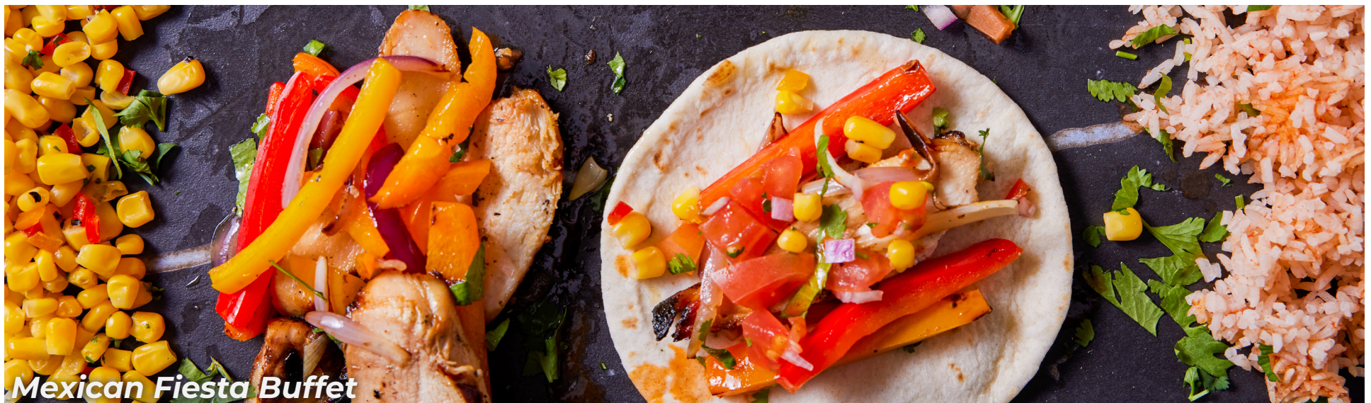
Mexican Fiesta Buffet