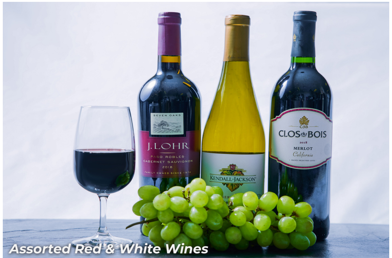
Assorted Red & White Wines

Hosted bars are charged by consumption. For non-hosted bars, guests pay for their own drinks.