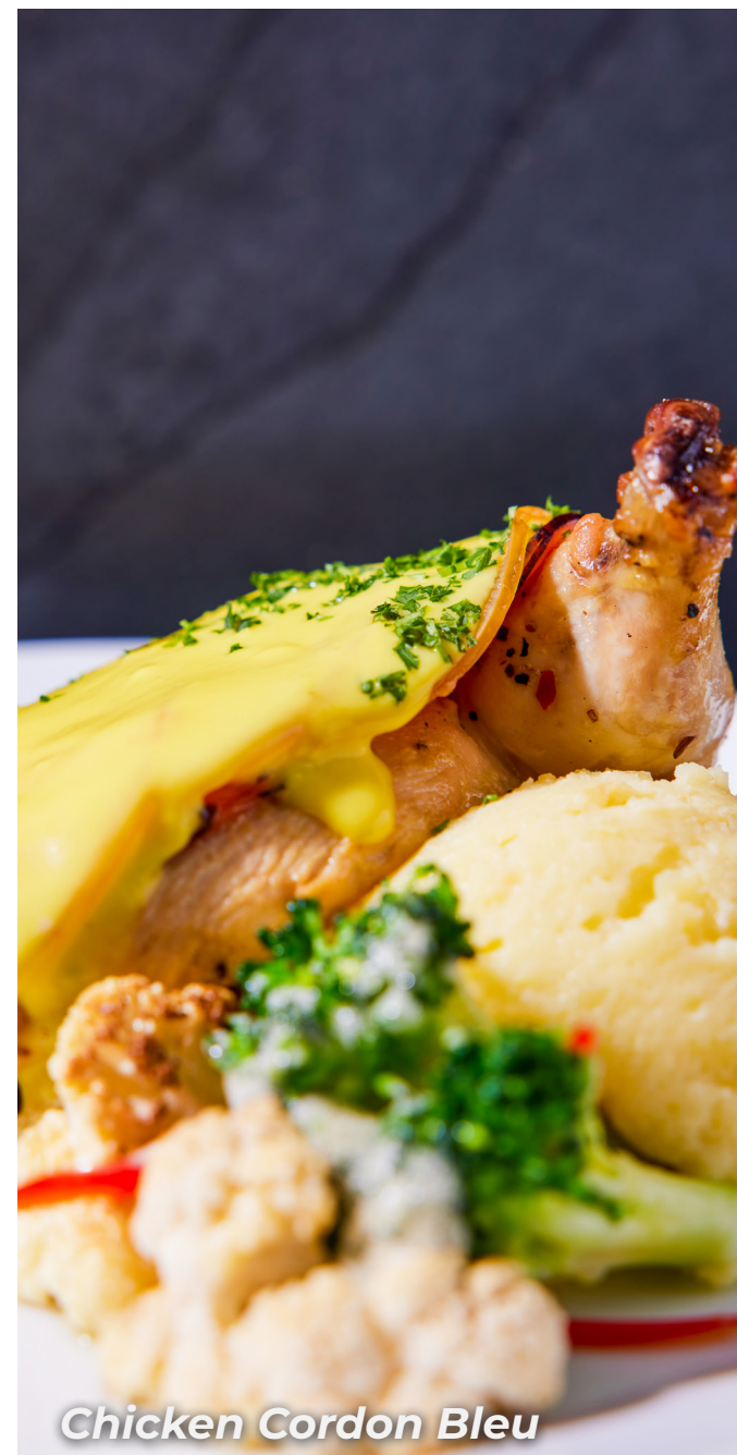
Chicken Cordon Bleu

Chocolate Layer Cake New York Cheesecake Raspberry Cheesecake Chocolate Bundt Lava Cake Italian Lemon Cake Tiramisu Cake Chocolate Torte 🍴