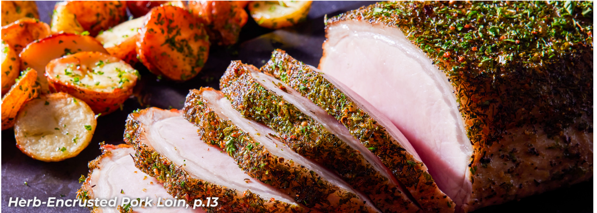
Herb-Encrusted Pork Loin, p.13

All Food and Beverage and Audio Visual services are subject to a 22% Management Charge. The entirety of this Management Charge is the sole property of the venue owner/operator and is used to cover that party's costs and expenses in connection with the administration of the event (excluding employee tips, gratuities, and wages).