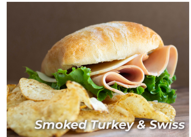
Smoked Turkey & Swiss