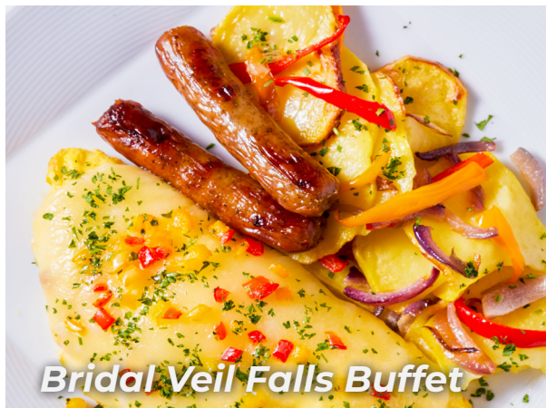
Bridal Veil Falls Buffet